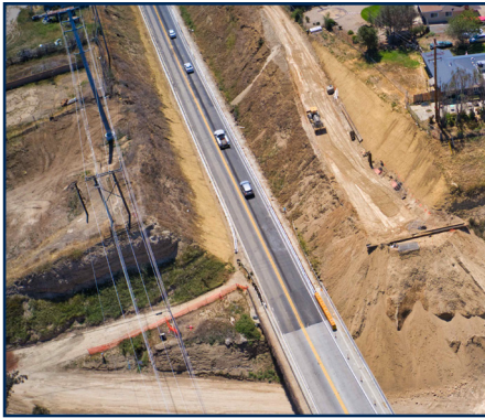
Aerial view of the project looking south with shoring work on bridge support system to the right.